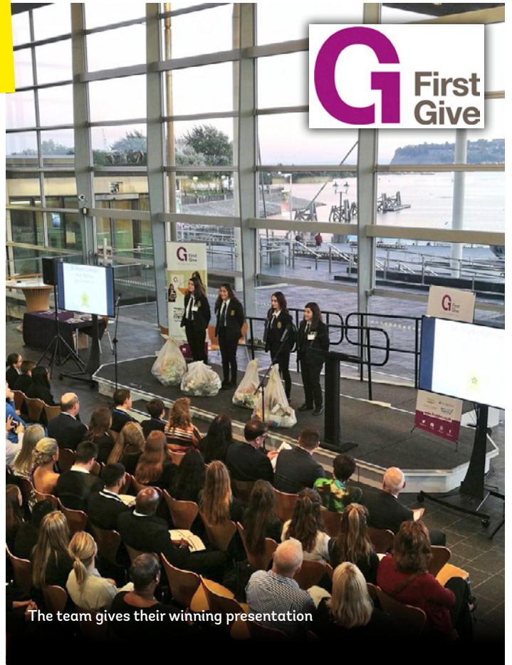
The team gives their winning presentation

A group of four students have put St Illtyd's Catholic High School on the map taking centre stage at the Senedd for the annual First Give Awards, winning £1,000 of grant money for their school.