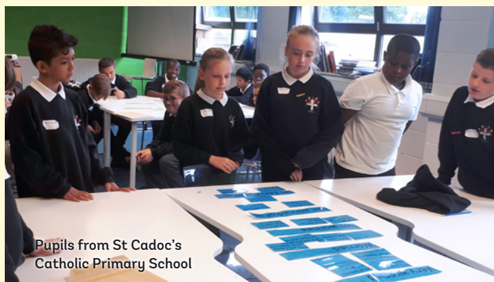
Pupils from St Cadoc's Catholic Primary School

In addition, our new Additional Learning Needs pupils and their parents have visited the school for sessions to enable them to feel completely prepared for when they start with us in September.