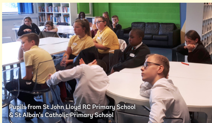
Pupils from St John Lloyd RC Primary School & St Alban's Catholic Primary School