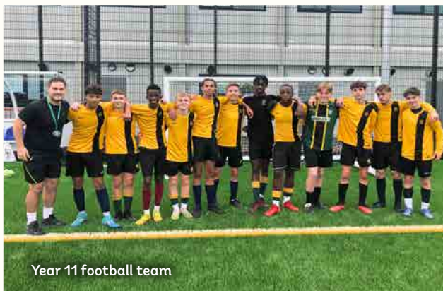
Year 11 football team

Year 10 narrowly lost in a great first round game against St Cyres. They will play Whitmore in the next round of the plate.