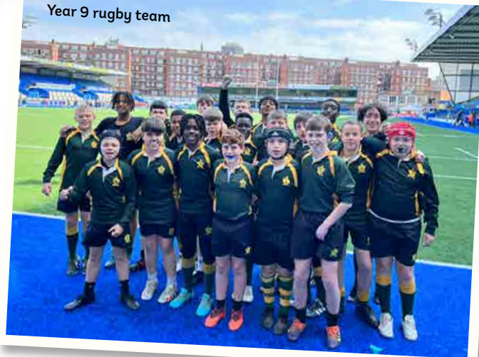
Year 9 rugby team

With the game coming to a close and Bro Edern in-front, St Illtyd's threw everything at them and came close to taking the lead, only for Bro Edern to hold out and take the win. In their latest game, St Illtyd's headed to Radyr. Radyr tried to play an expansive game, negating St Illtyd's strong forward play and defence around the tackle area. However, St Illtyd's proved too strong. With strong interplay and offloading between the forwards and backs, St Illtyd's scored some well-earned tries. They look forward to the next round of the Cardiff Schools Cup.